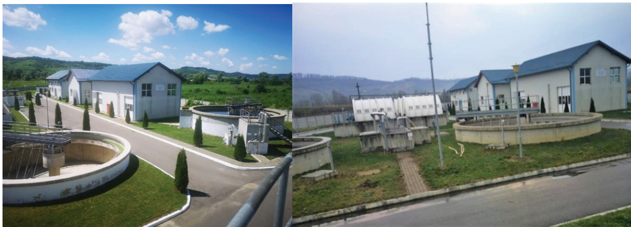
Figure 1. Dumbrăveni wastewater treatment plant (original).

The Dumbrăveni wastewater treatment plant (Fig. 1) has the role of mechanical-biological treatment, with rotating biological contactors, to clean the wastewater collected from the sewerage network, from pollutants and impurities, in order to be returned clean into the natural circuit.